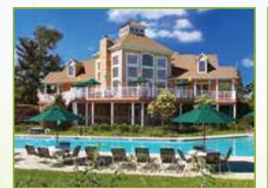
Heritage Orchard Hill - Clubhouse 1 Applewood Drive, Perkasie, PA 18944