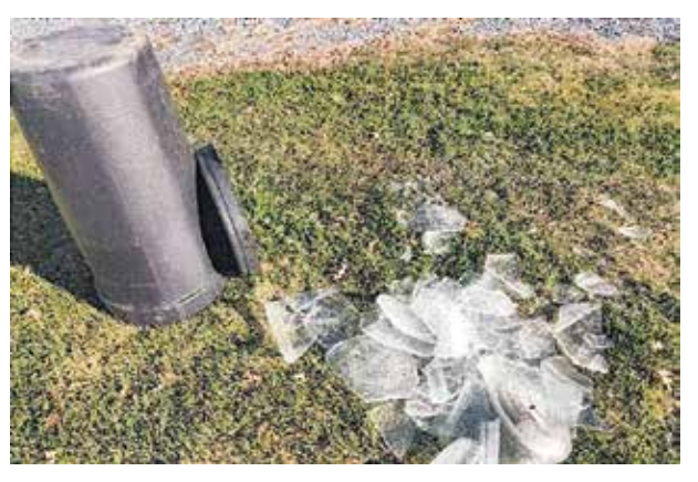
Empty and disconnect your rain barrel in the fall to avoid damage from freezing water.

A hard freeze is when the temperature dips below 28°F for an extended period. This cold weather is enough to turn a barrel of water into ice. Pennsylvania's typical first hard freeze date varies from early October in some northern counties to late November in